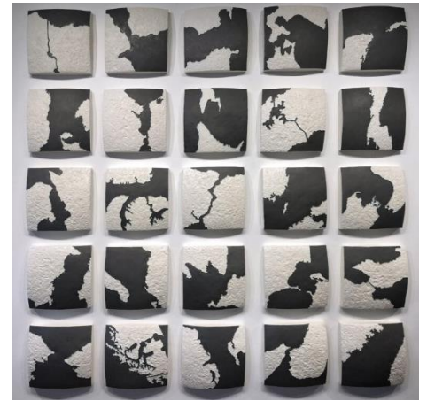
Gregor Turk Choke II: Grid of 25, ceramic, 14 x 14 x 3 inches each

“Through my art, I tend to focus on the fundamental qualities of mapping— the mysteriousness, inherent biases, cultural authoritativeness, and ability to simultaneously represent and distort reality.” - Gregor Turk